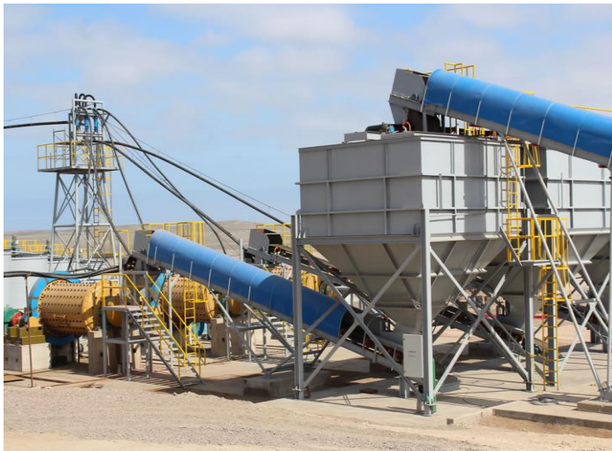
Kori One Plant crusher and ball mills circuit