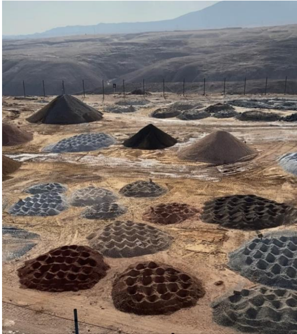
Ore piles in stockyard awaiting processing