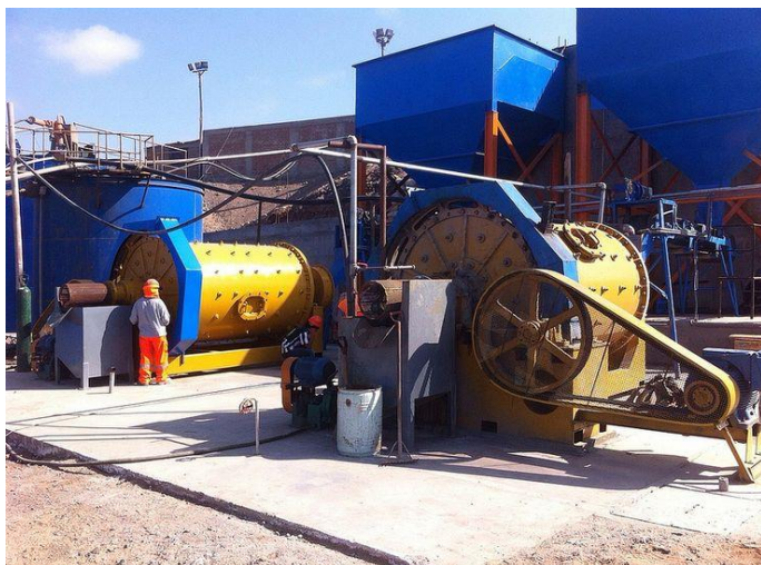
Inca One Plant ball mills and crusher circuit